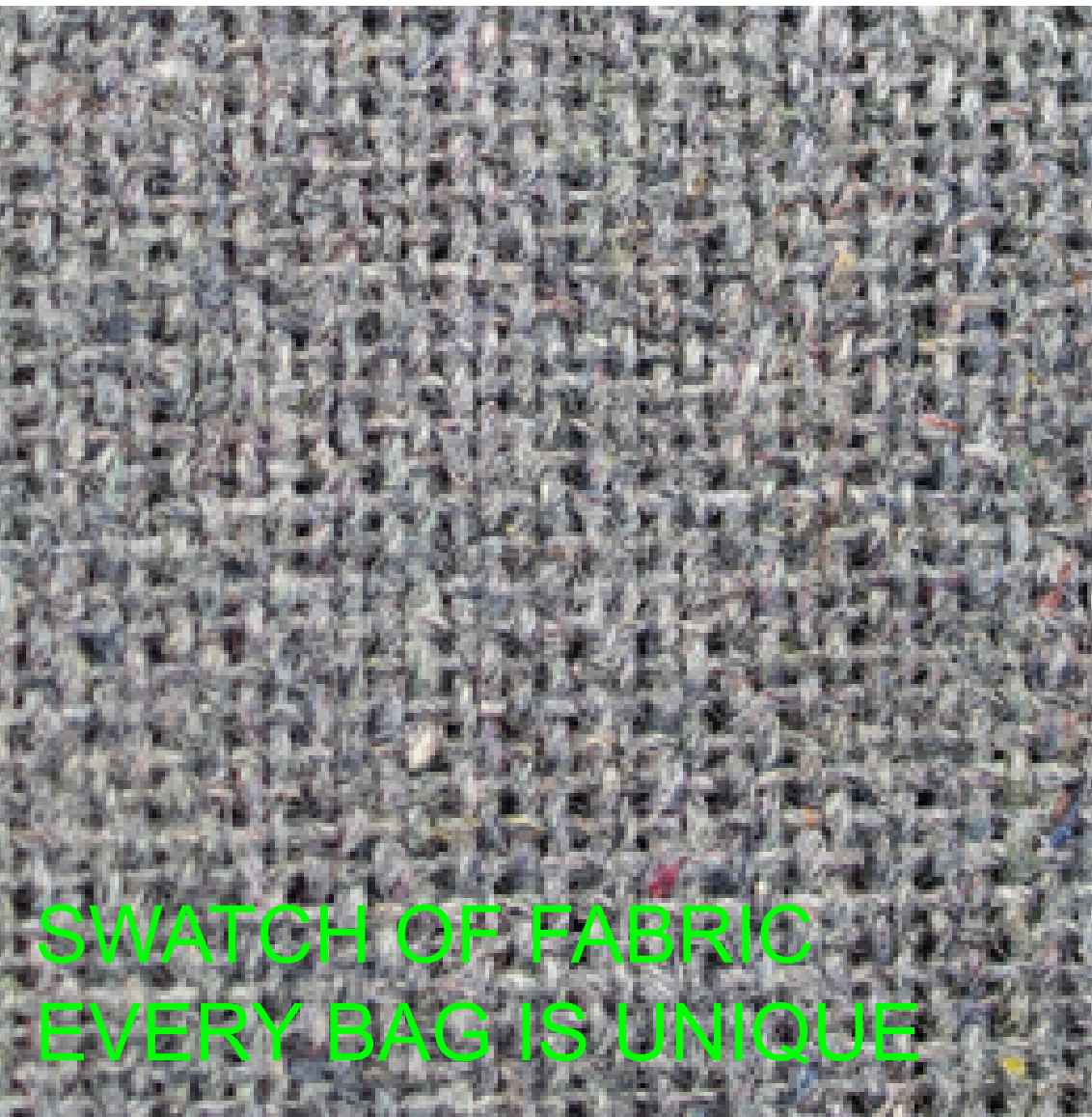
SWATCH OF FABRIC EVERY BAG IS UNIQUE

Branding Method: Screenprint Maximum size 22.5cmx26cm Max 1 x colour screen print Fine details may fill in when screenprinted.