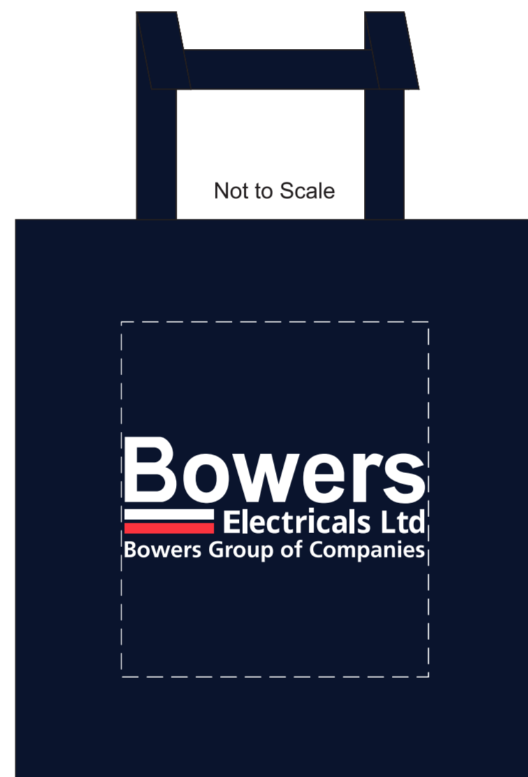
Product colour shown is a representation only.