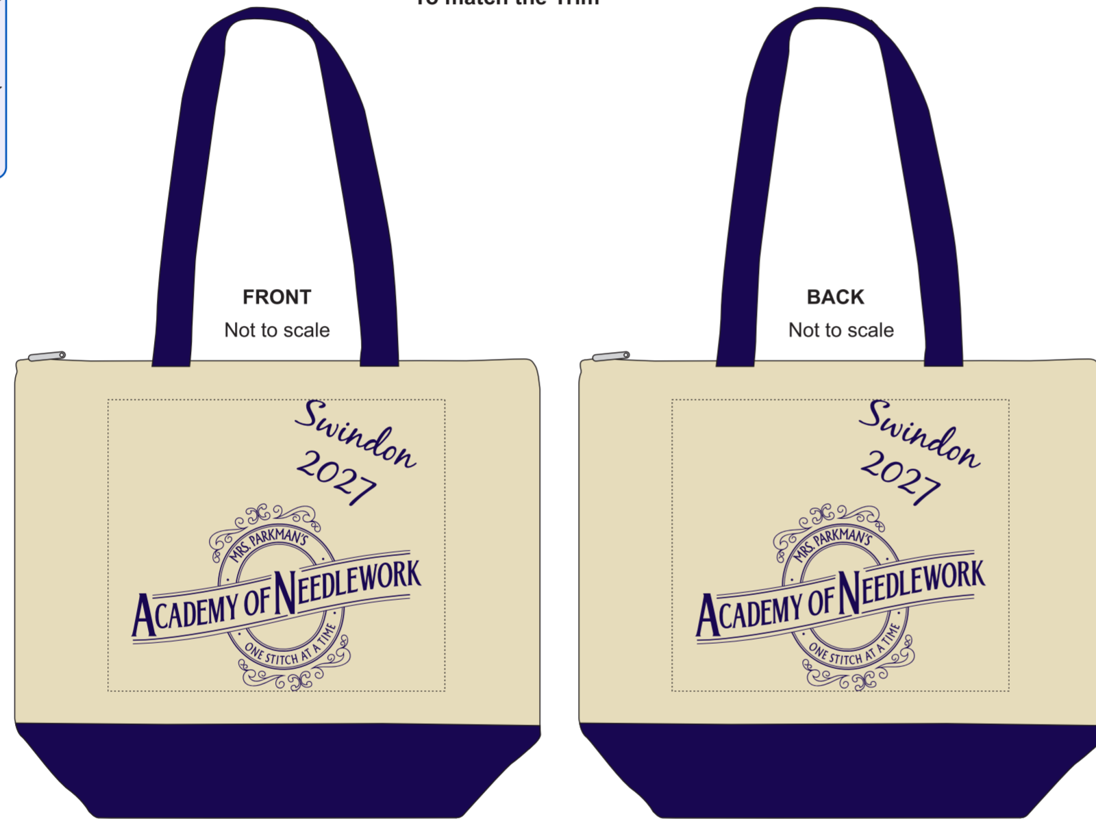
Product colour shown is a representation only.