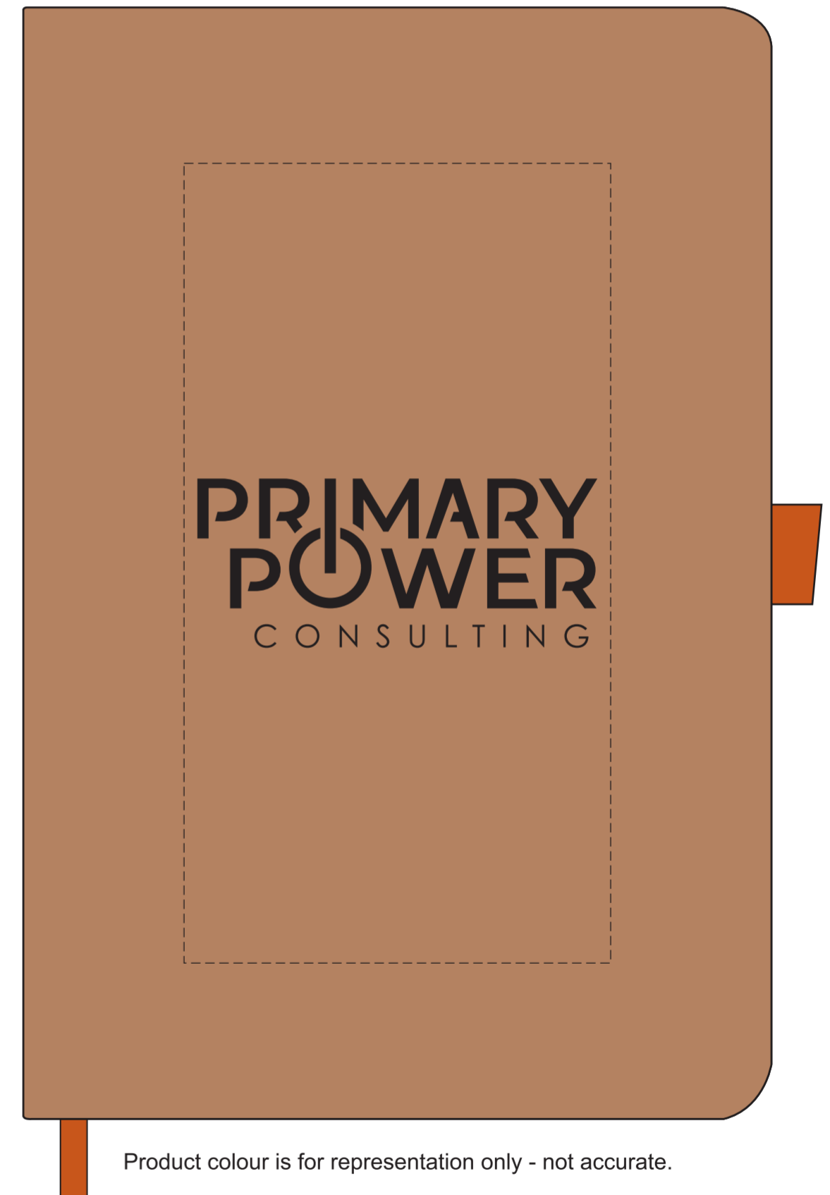
Actual Size BAND REMOVED

Product colour is for representation only - not accurate.