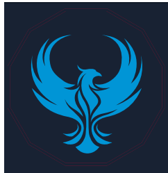
Artwork 21mm diameter Enamel