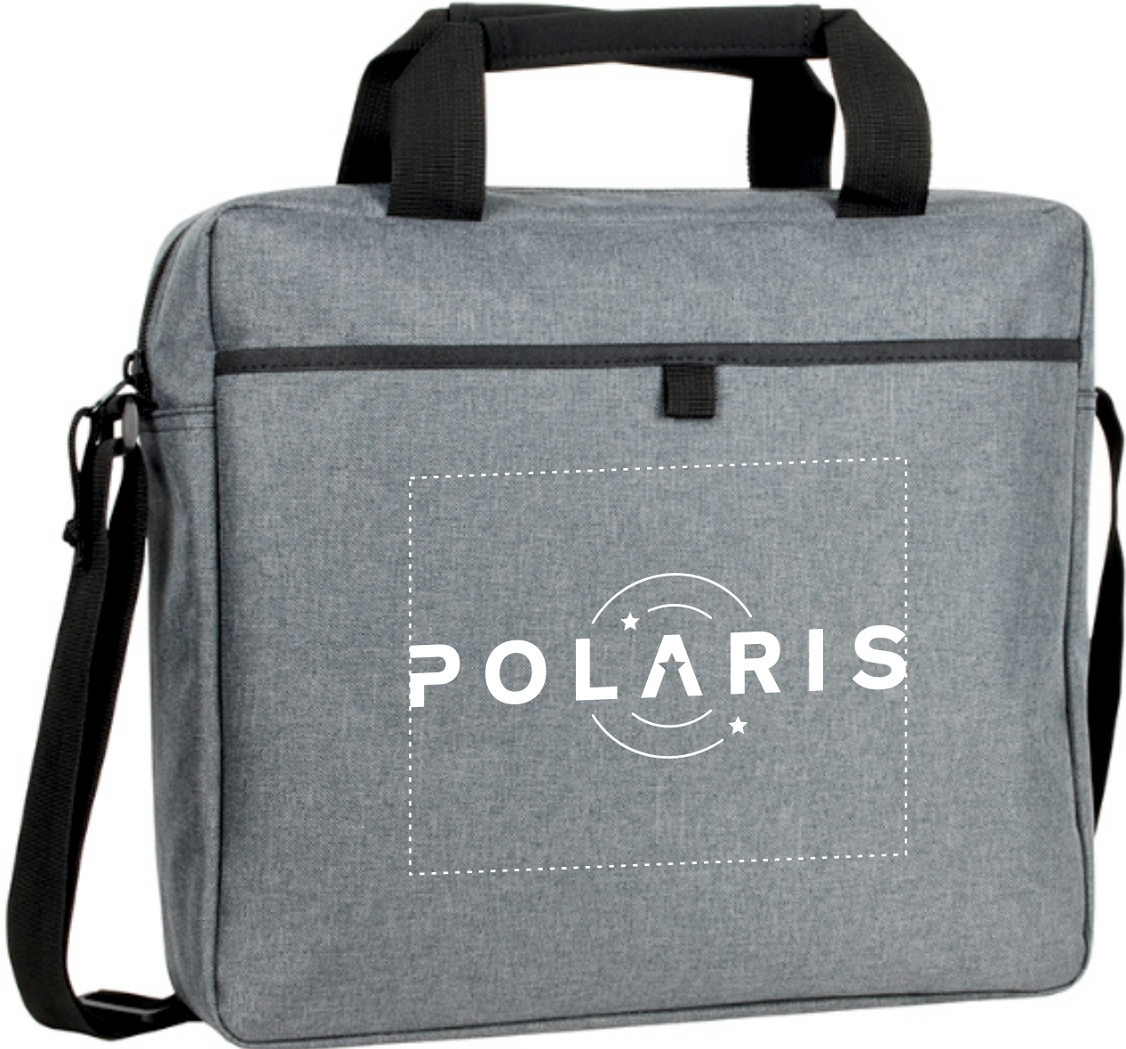
Product colour shown is a representation only.