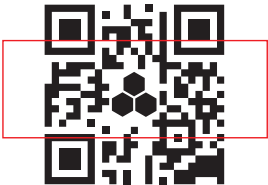
Print Size: 80mm in width and 51mm in height.

+44 2392 584 222 sales@sts-defence.com www.sts-defence.com /// jeeps.rested.statue