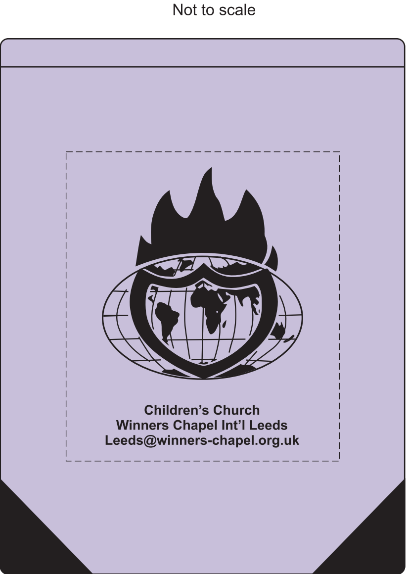
Product colour shown is a representation only