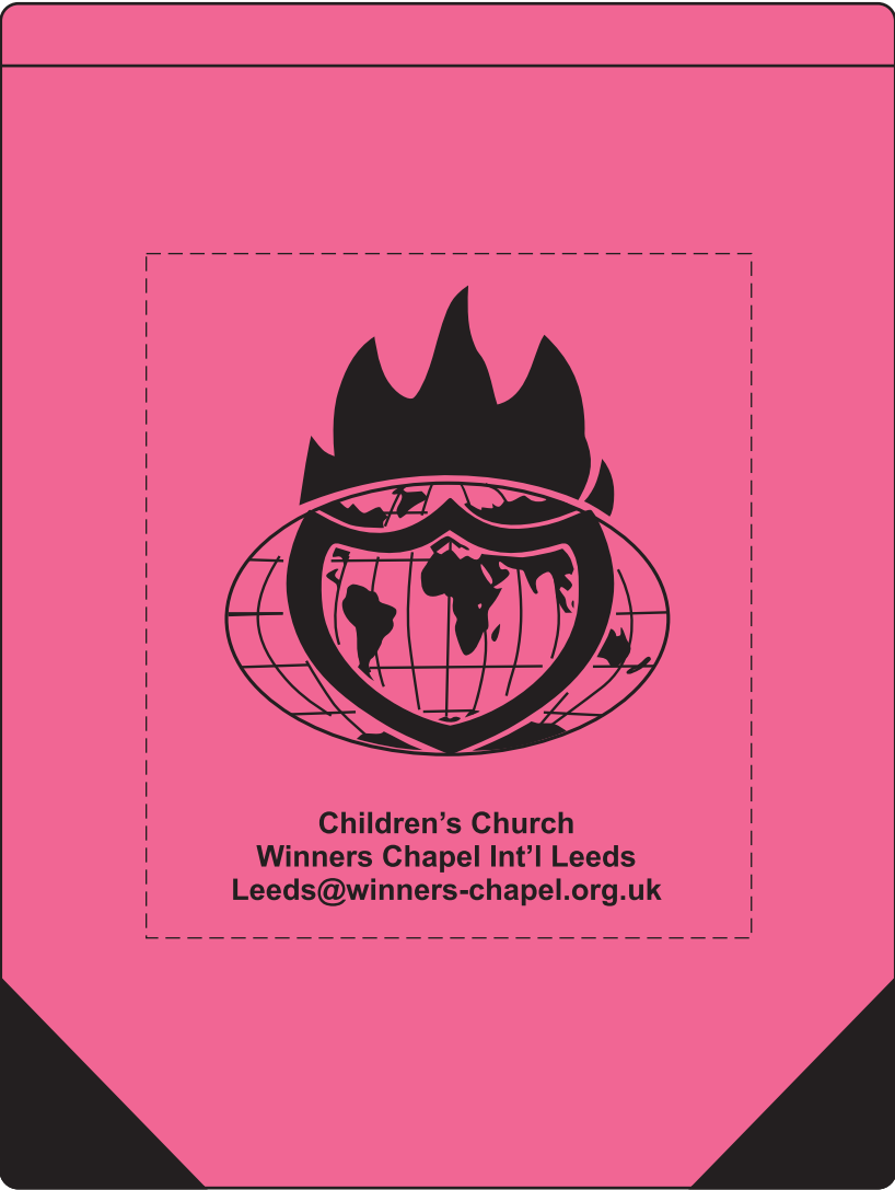
Product colour shown is a representation only