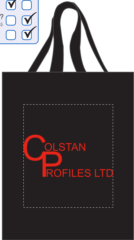
Not to scale FRONT

Due to the nature of the surface of the fabric small details & text are not achievable. Text cannot be smaller than 30pts.