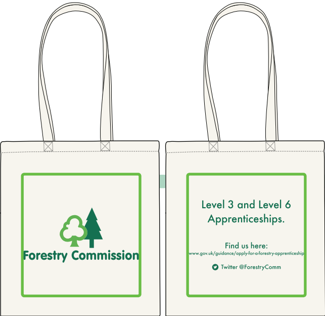
TEMPLATE INFORMATION SHEET