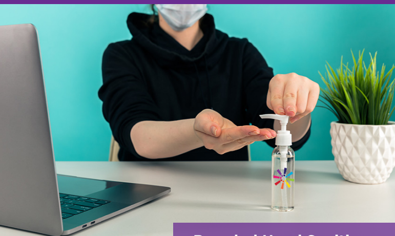
Branded Hand Sanitisers

Extend the impact of your virtual meeting after the event and reinforce key messaging