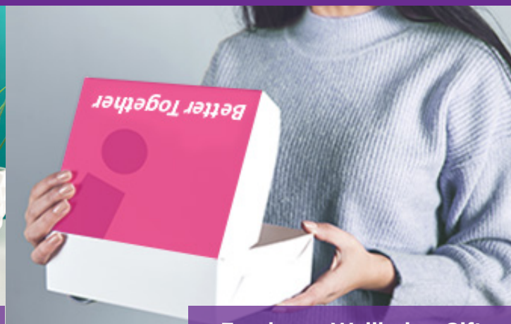
Employee Wellbeing Gifts