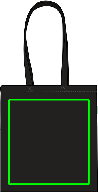
TEMPLATE INFORMATION SHEET

We only screenprint in Uncoated Pantones. Colour will vary by batch, due to its recycled nature.