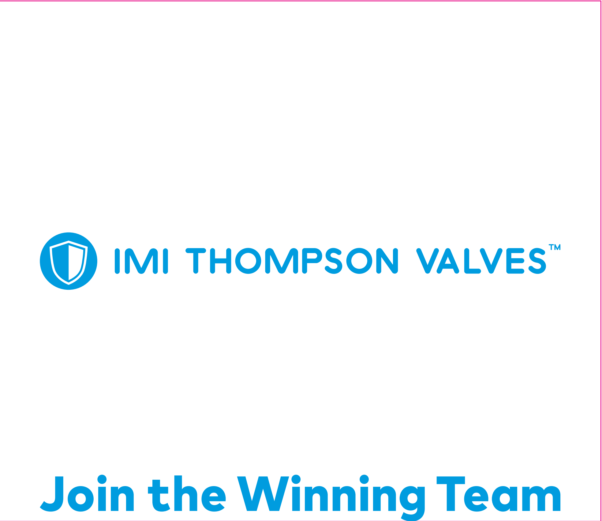
ARTWORK TO SCALE - 225mm X 124.9mm PRINT AREA - 260mm x 225mm

ITEM:SEABROOK 50Z RECYCLED COTTON TOTE BAG