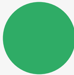
PANTONE® 3405 C C75 M0 Y75 K0 R46 G172 B102