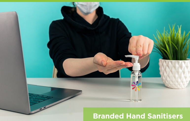
Branded Hand Sanitisers

Extend the impact of your virtual meeting after the event and reinforce key messaging