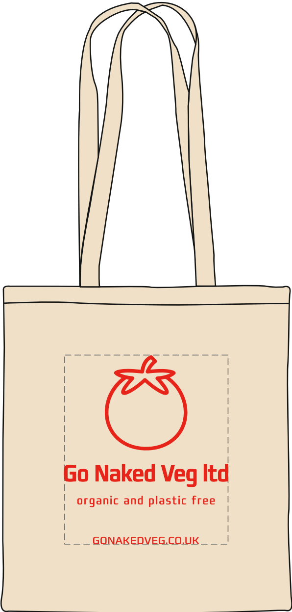
FRONT Reduced layout

Product colour shown is a representation only.