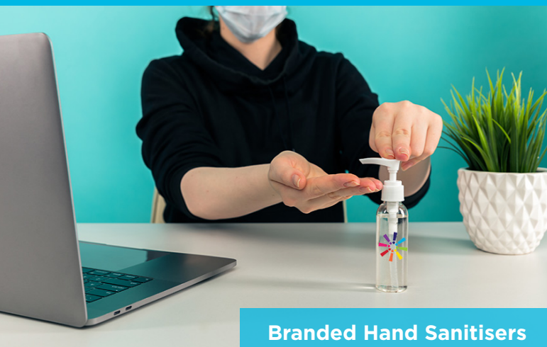
Branded Hand Sanitisers

Extend the impact of your virtual meeting after the event and reinforce key messaging