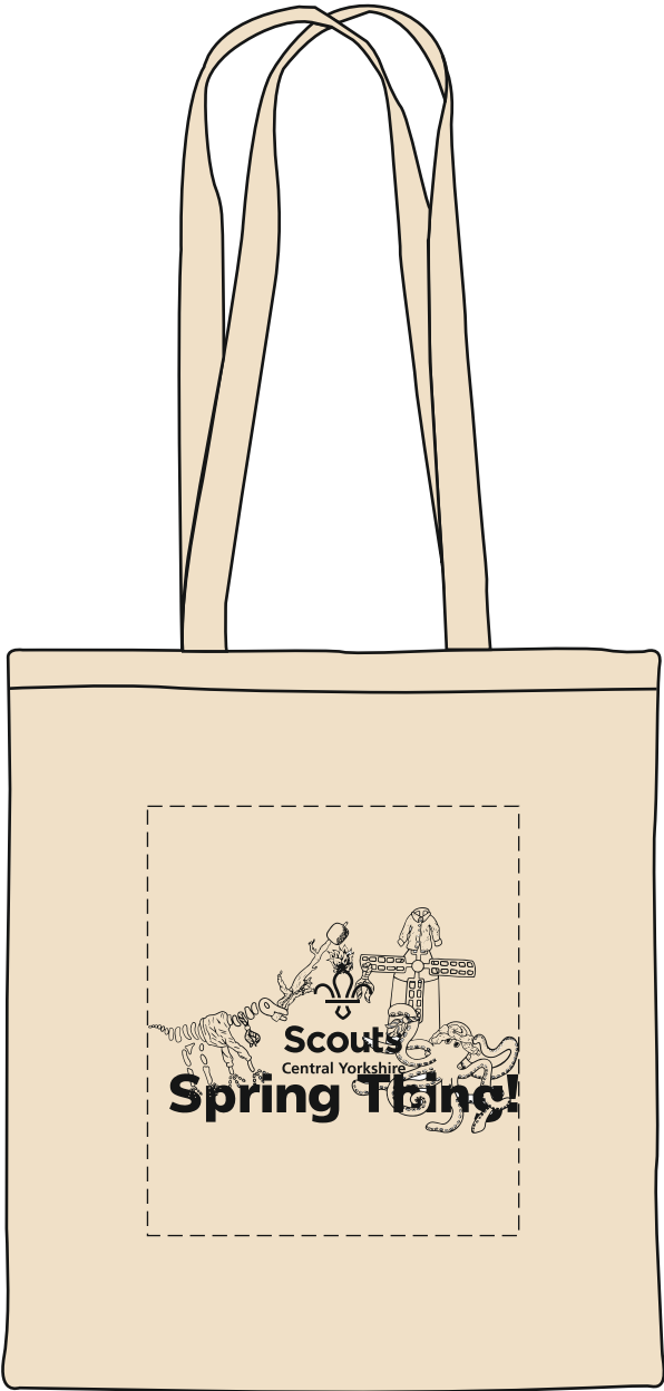
FRONT Reduced layout

DISCLAIMER - PLEASE NOTE The quality of the artwork supplied was poor so this has been reproduced as close to the original. The finer and smaller details will fill in when printed, the ink will also absorb into the material of the bag and details may be lost. Some of the details will differ slightly. Please advise if this is acceptable.