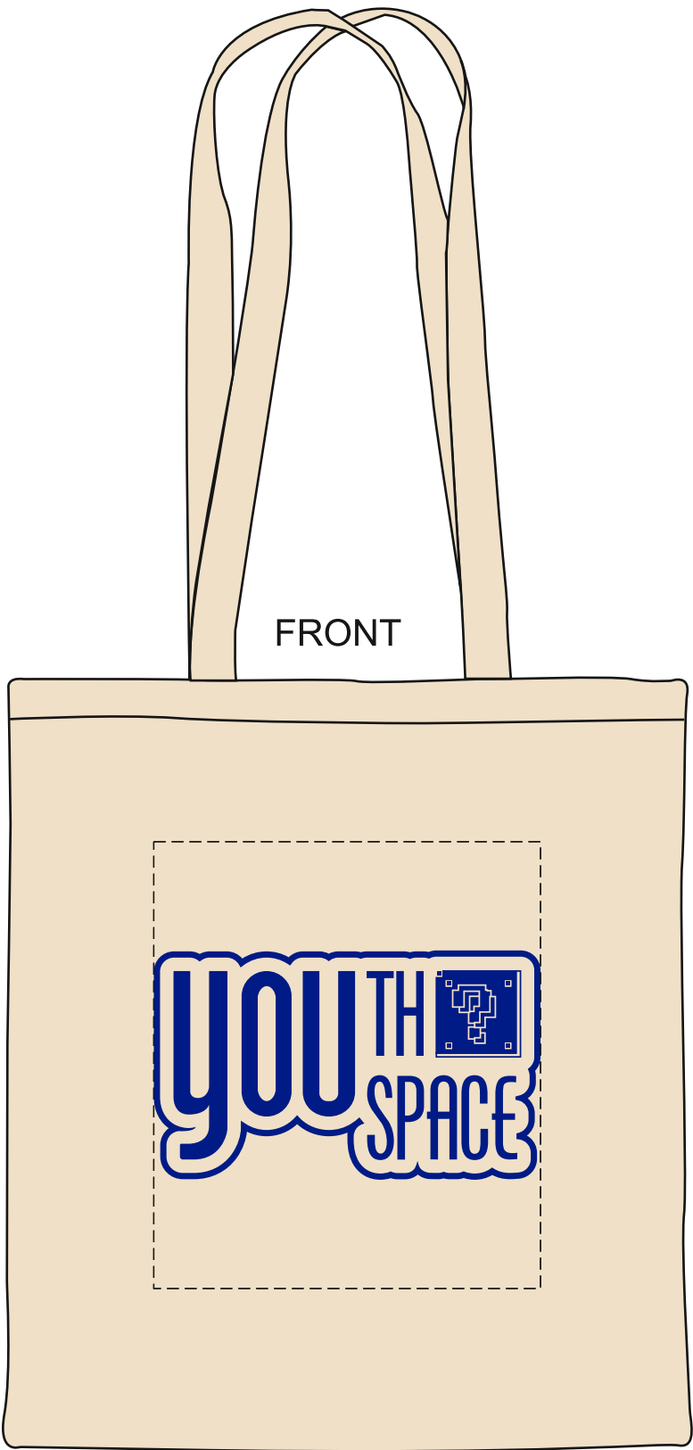
Product colour shown is a representation only.

Actual artwork size: 133mm deep x 225mm wide.