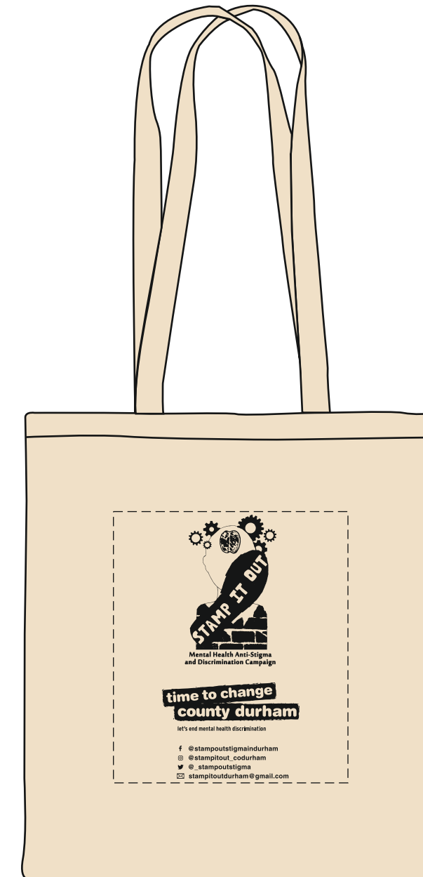
FRONT Reduced layout

Product colour shown is a representation only.