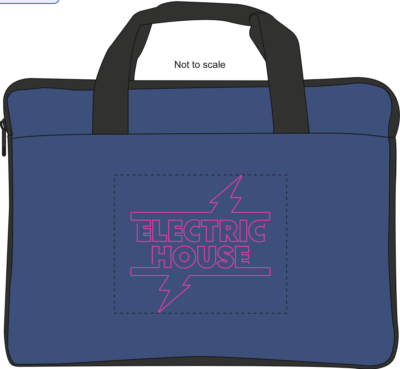
Product colour shown is a representation only.