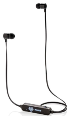
Light Up Logo Wireless Earbuds