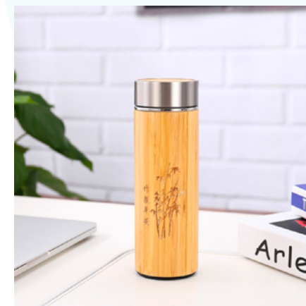
Bamboo Flask - 450ml