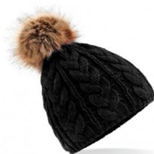
Beechfield Fur Pop Pom Cable Beanie