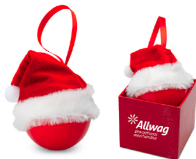
Santa Hat Bauble

Each week we select new products that may interest you. Have a look at what we have chosen or visit our website for more inspiration.