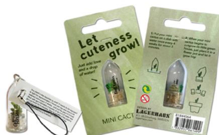
Grow Your Own Cactus Keyring