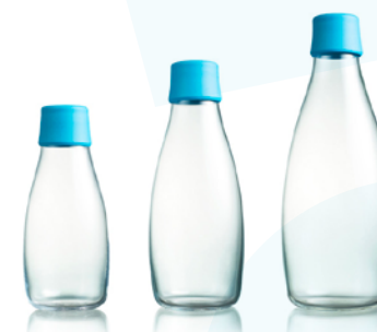
Retap Glass Bottle - 500ml