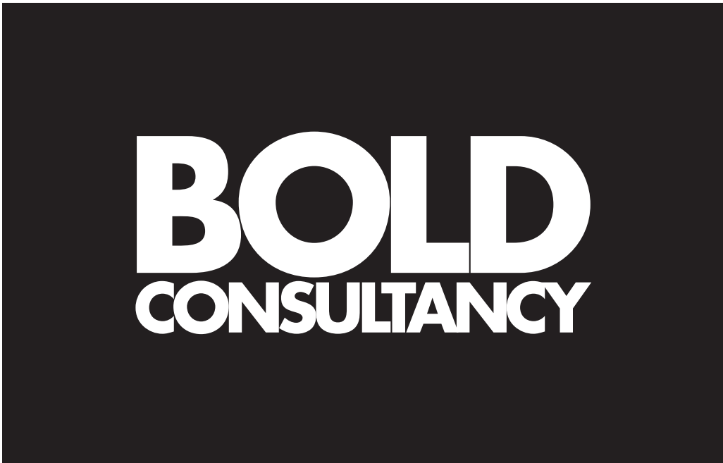
Reversed out of black